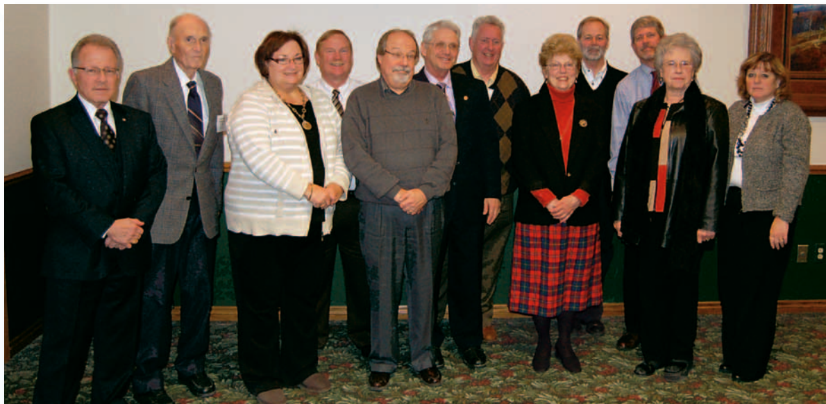
Emeritus Members at the 2010 dinner.