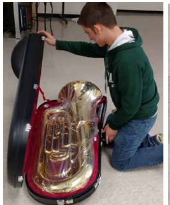
Dryden's new tuba!