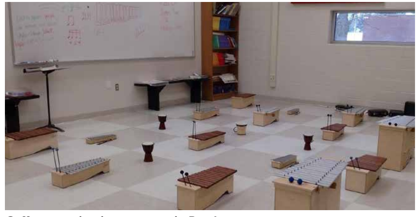
Orff percussion instruments in Dryden