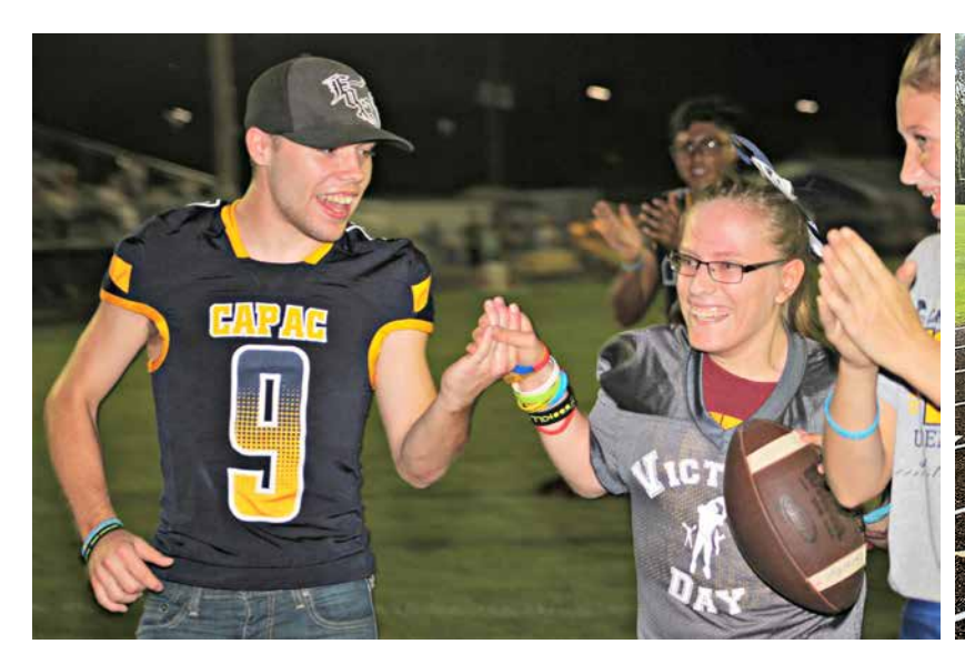
The Youth Advisory Committee was privileged to participate in the 3rd Annual Capac/Imlay City Victory Day under the lights, an event that received partial funding from the YAC Kellogg Fund.