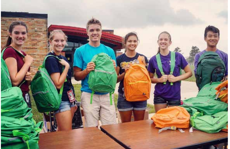
Members of the 4CCF Youth Advisory Committee help pass out backpacks at Capac's annual back to school backpack giveaway.