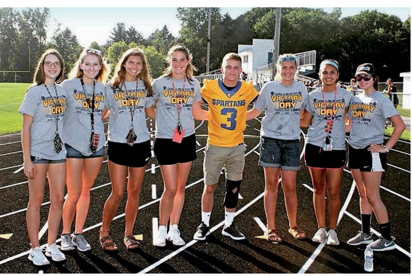
Victory Day is a fully funded sports event which allows children and young adults, ages 5-26 with cognitive, developmental, and/or physical disabilities to experience a day of football and fun at Capac Football Stadium.