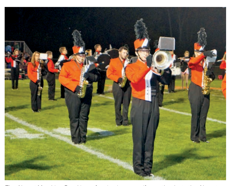
The Almont Marching Band is performing in new uniforms, thanks to the Almont Music Boosters and 4CCF. The Foundation is pleased to support Arts and Culture in the communities we serve. From uniforms and concerts-in-the-park, to historic preservation and commemorations, Arts and Culture help to make our community a delightful place to live.