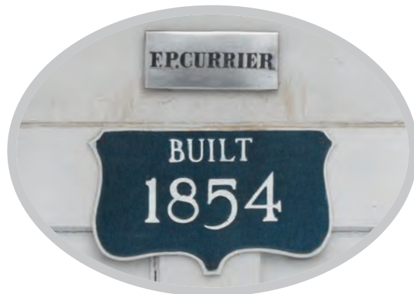
Currier House Name Plate