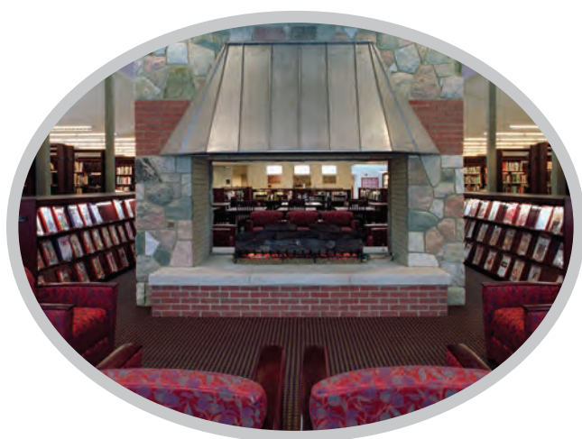
Oxford Public Library