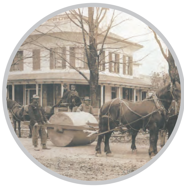
Currier House from E. St. Clair Street